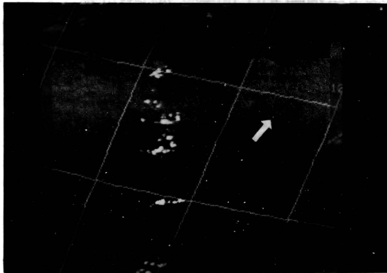
Fig.3 channel 3 satellite of prescribed burning (0.64ha) (Oct. 5.1987)

It is very unfavorable to monitor fires when fire targets locate at lower temperature pixel. In order to check the ability of satellite fire monitoring, we had made use of field prescribed burning to contrast with satellite image (3 channel). Fire intensity then was not more than 3000 \text{ kw} / \text{m} . Fire area was break-off in middle and its size about 0.64ha. Fig3 shows that the field experiment agree with the estimate