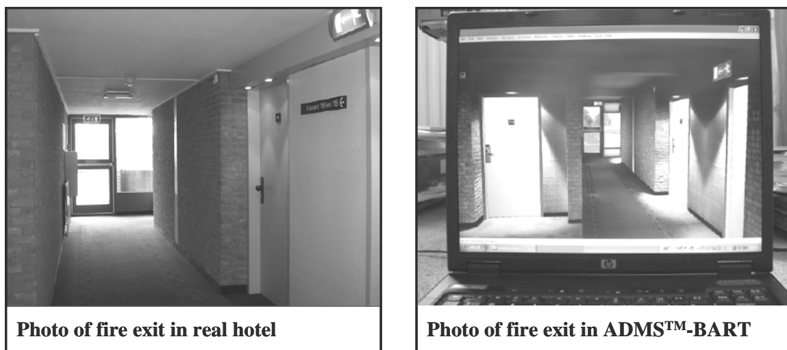
FIGURE 2. Degree of similarity between the real hotel and the virtual hotel

For making the software of ADMS TM suitable for behavioural research, the software is extended with several functionalities. Primarily, a tracking and registration device is implemented which generates the required data for behaviour analysis. With this the test persons' movements within the virtual building is automatically stored. The tracking and registration device consist of a 3D real time movie, a time/event database and a run path diagram. An other important functionality is the additional object (a hotel) that has been visualised in the simulator. Therefore pictures are taken of the interior and exterior of a Dutch hotel. In Fig. 2 the degree of similarity between the real hotel and the virtual hotel is shown.