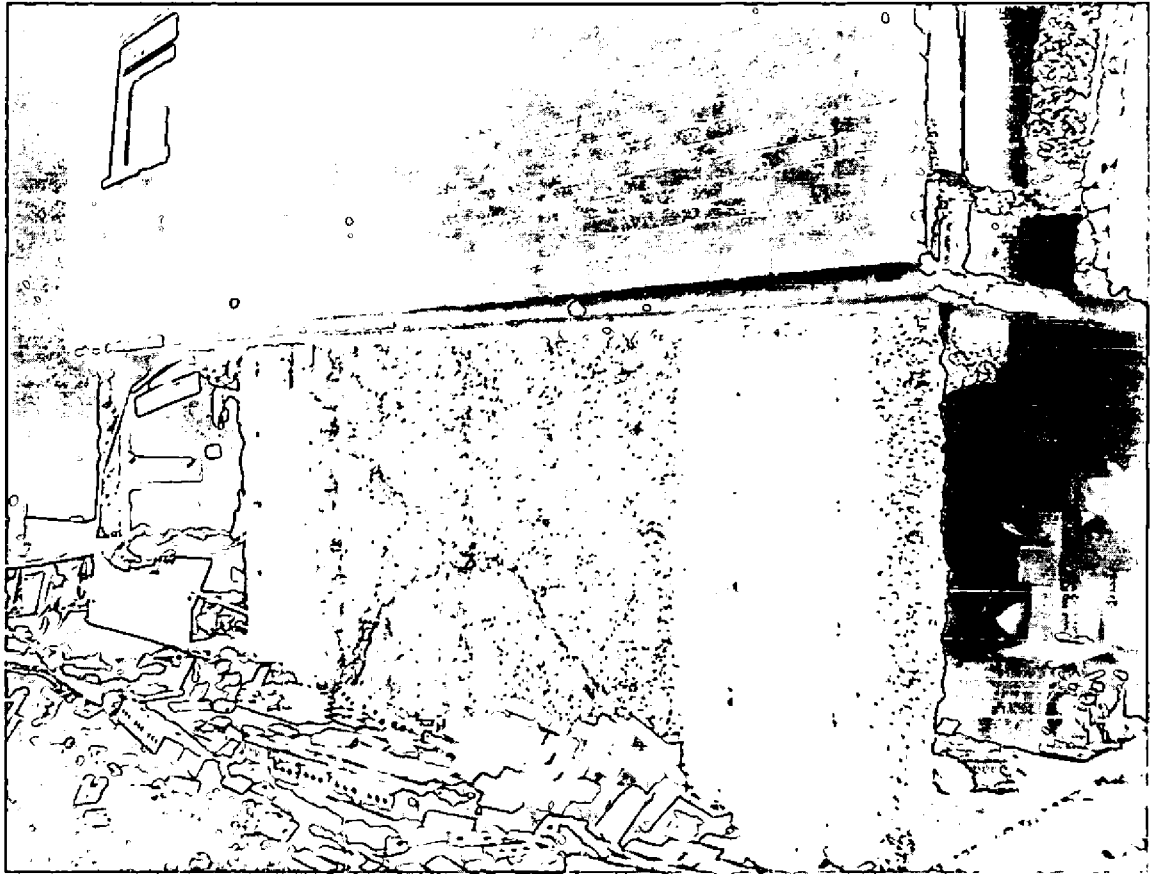
FIG.3 MERSEY HOUSE, BOOTLE N.FACE OF GROUND FLOOR