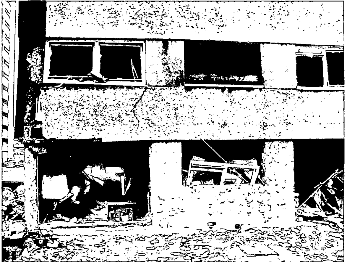
FIG.2 MERSEY HOUSE, BOOTLE GROUND AND FIRST FLOOR NW CORNER OF WEST FACE. LOUNGE OF GROUND FLOOR FLAT