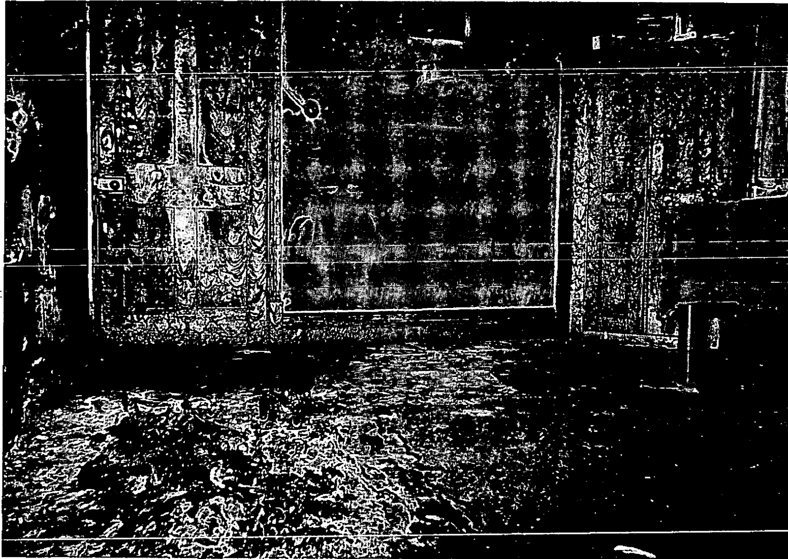
PLATE 1. LIVING ROOM WITH CLOSED DOORS AND WINDOWS, IN WHICH FIRE BURNT ITSELF OUT. LEFT FOREGROUND REMAINS OF SETTEE. CENTRE WALL, MARKS SHOWING POSITION OF CHAIR AND CHINA CABINET WHICH WERE ONLY BLISTERED.