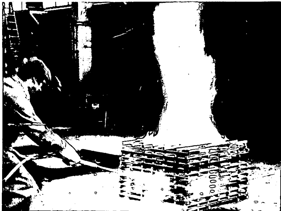
TEST 8 Crib fire after 3 second discharge of nitrogen