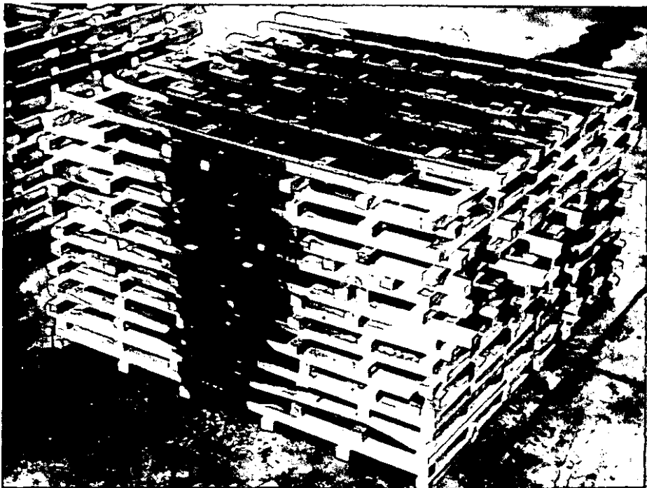
TEST 8 Condition of crib after discharge