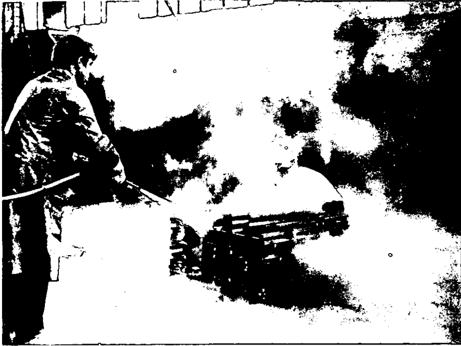
TEST 8 Crib fire extinguished after 20 seconds discharge