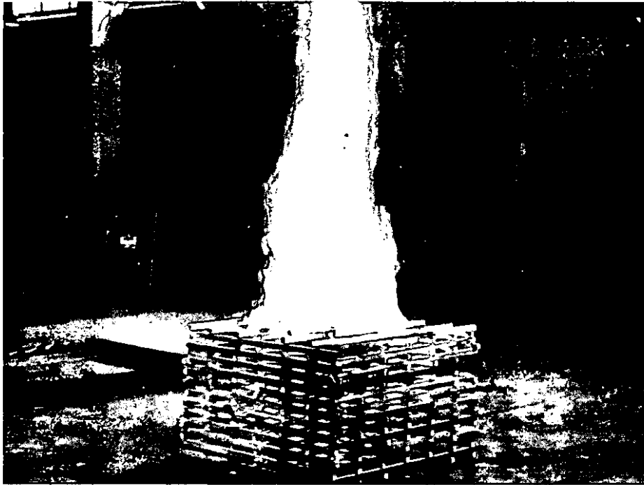
TEST 8 Condition of crib fire after 4 min preburn