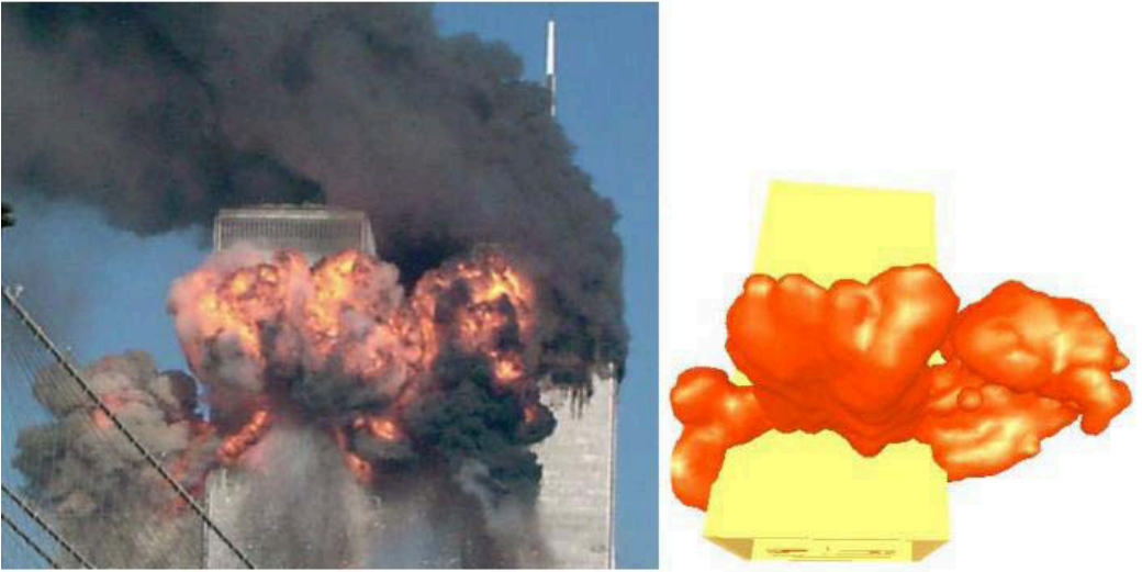
Figure 6: Comparison of a photograph and a simulation image of the south tower fireball shortly after the collision with the second hijacked plane.