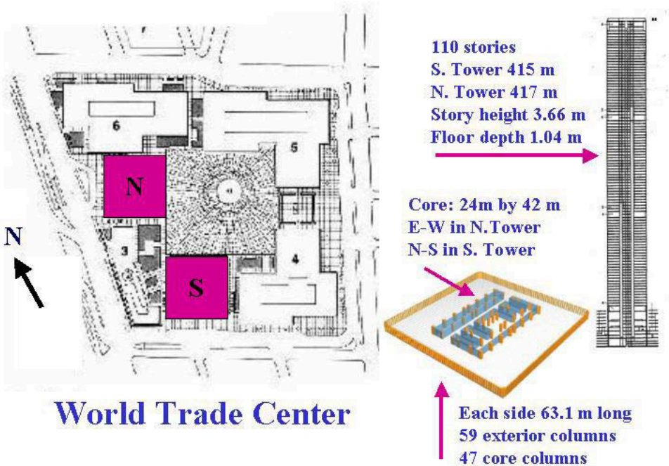
Figure 1: The layout of the World Trade Center complex and information about the twin towers. (WTC layout from web site www.greatbuildings.com . Floor layout from [8]. Vertical section of tower from [9].)

The planform of each tower was square with side 63.1 m (207 ft), also as shown in the schematic diagram of a tower floor near the center of Figure 1 [8]. Within each tower was a core measuring 24 m by 42 m composed of 47 box-section load-bearing columns. The long axis of the core in the north tower ran east and west, and that in the south tower ran north and south. The core and facade columns constituted the load-bearing structures for each tower, including the potentially high loads produced by winds. Along each exterior surface, there were 59 box-section facade columns spaced 1.02 m between centers [9].