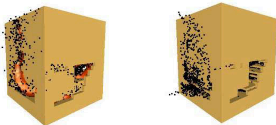
Figure 5: A comparison of two simulations of the fire in the north tower, with very different assumed internal damage geometries and fuel distributions. The left simulation shows very large flames extending from the damage holes, whereas that at the right shows little flame extending out of the exterior damage holes. The simulation on the right seems to agree much more with pictorial records, indicating that these postulates are better.