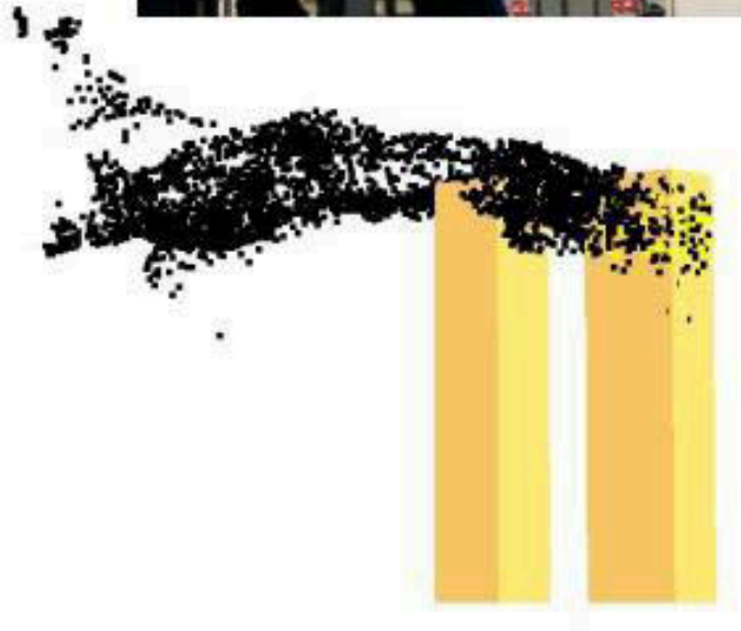
Figure 4: Comparison of a photograph and of a frame from simulation of the WTC tower fires, showing the quasisteady smoke plume generated by the fire in the north tower.