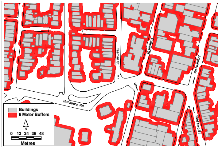
Figure 1: Examples of burn out zones for a mixed residential/commercial area of Wellington City.

The width of "buffer" space around each building is therefore 6m, and fire spread is possible whenever adjacent buffer zones come into contact as shown in Figure 1. Burnout zones range in size from a single to many buildings. Adjoining vegetation is assumed to be non-combustible.